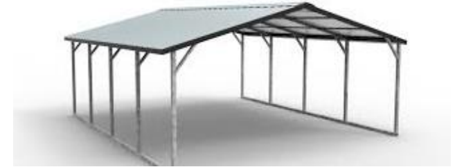
Squared Frame Vertical Metal Roof Style Standard 6' Leg