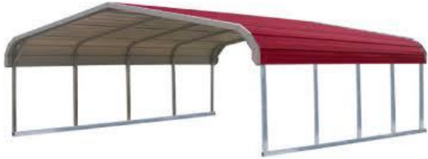
Rounded Frame Horizontal Metal Roof Style Standard 6' Leg

29 GAUGE, 40 YEAR METAL 15 GAUGE 2.5" X 2.5" TUBING STANDARD ANCHORS INCLUDED SCREW DOWN ANCHORS AVAILABLE EXTRA OPTIONS AVAILABLE MANY COLORS TO CHOOSE FROM MADE IN THE USA